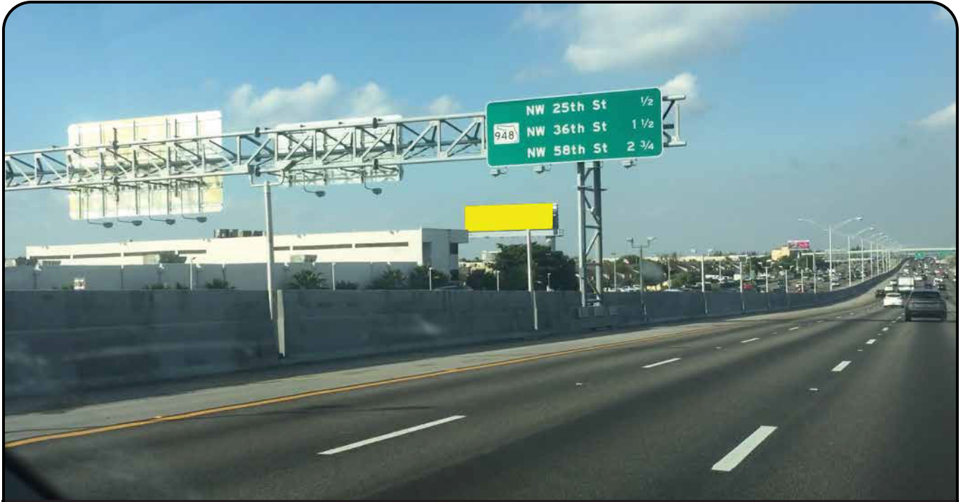
1006S Palmetto Expressway West Side 1/4 mile North of Dolphin Expressway Northbound